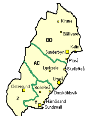
Figure 3. The northern Region

The county of Västerbotten is one of the two northernmost counties in Sweden, covering a landmass of 55,432 km 2 . The population is about 260,000, and more than half of the population live on the coastline. The average population density is about 16 persons per km 2 on the coastline, but only 1.4 km 2 in the inland (Fig. 4). 16