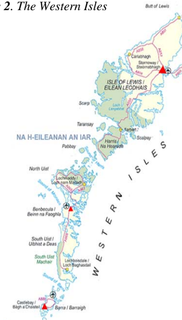
Figure 2. The Western Isles

Geographically, the Highlands and Islands of Scotland cover a land mass equivalent in size to Belgium, (12,500 km 2 ) and are sparsely populated. There are 110 people/km 2 in Europe, 66 in Scotland, but in the Highlands and Islands it is only 10 people/km 2 . 2,10 Seventy percent of Scotland's population of 5,078,400 live in urban areas with the remainder scattered throughout remote and rural areas throughout the country. 11 The population of the Western Isles is 26,260, slightly over 5% of the national total and statistics show that since 1994 the number of people under 16 years has decreased by 9% while the number of those over 75 years has increased by 16%. 12 (Fig. 2.)